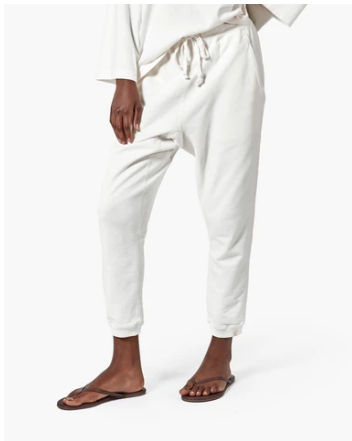
The Jogger $115.00