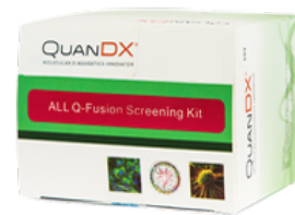
ALL Q-Fusion Screening Kit