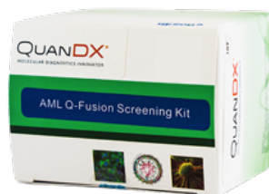
AML Q-Fusion Screening Kit