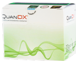
Leukemia Fusion Genes (Q30) Screening Kit