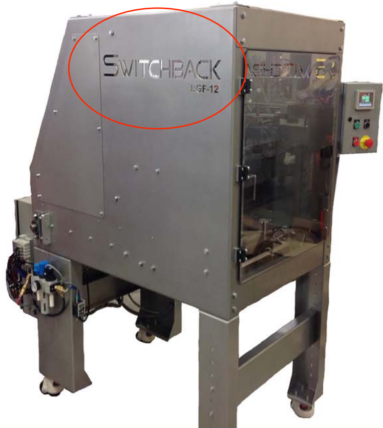
Corrugated Glue Style Trayformer For Brewery Trays