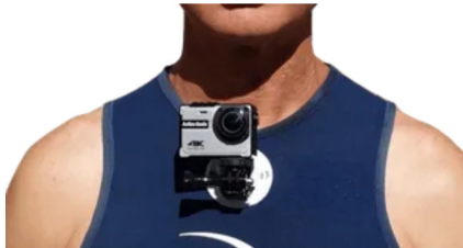
Action Camera with POV Surf Camera® mount