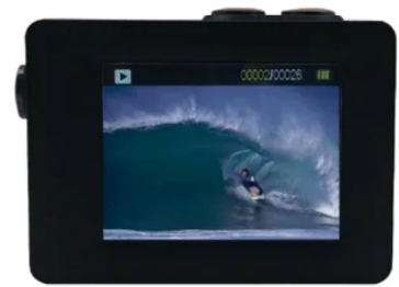
Amazing 2 inch screen