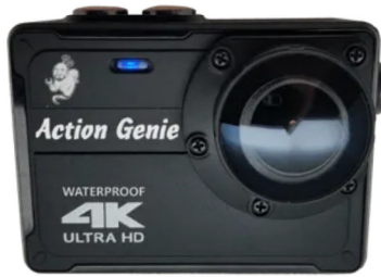
Waterproof to 30 Feet (No Case Needed!)