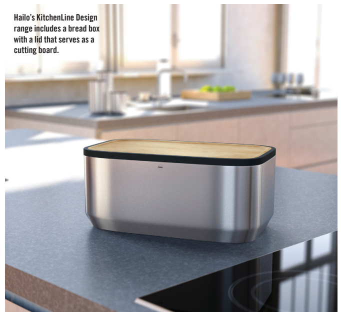
Hailo's KitchenLine Design range includes a bread box with a lid that serves as a cutting board.