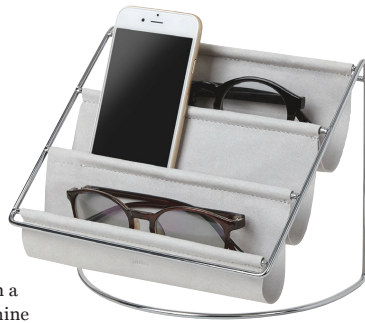
Umbra's Hammock suede glasses and accessories organizer.

trend, Umbra's new hexagon shaped Zina plated metal magazine rack can also be used to hold records.