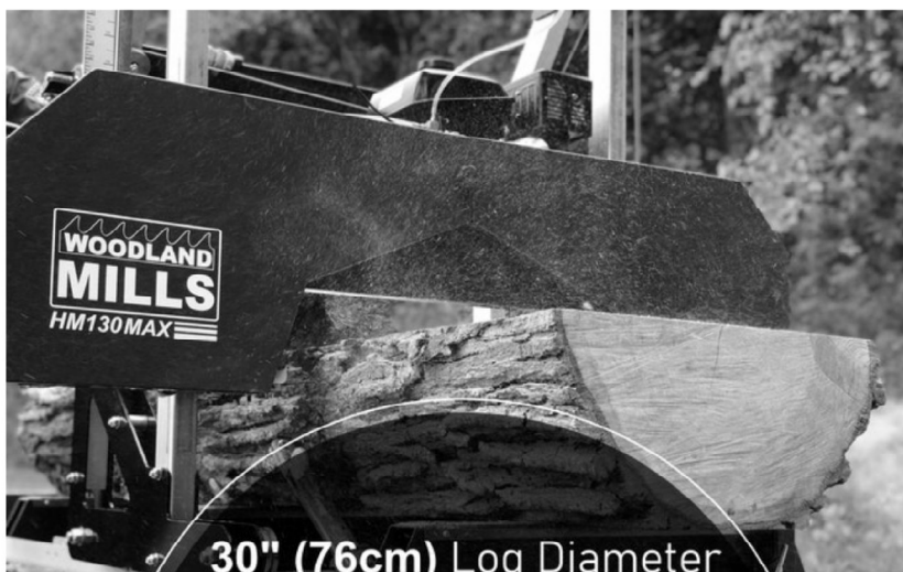
30" (76cm) Log Diameter