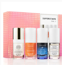
Superstars Kit Vol. 1 $130.00