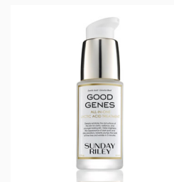
Good Genes Lactic Acid Treatment $85.00