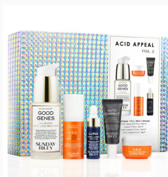
Acid Appeal Kit Vol. 2 $120.00