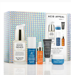
Acid Appeal Kit Vol. 1 $116.00