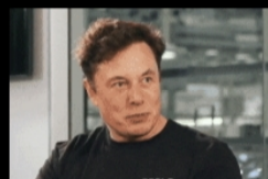
Any source video

We need just one face image and video source to achieve amazing results.