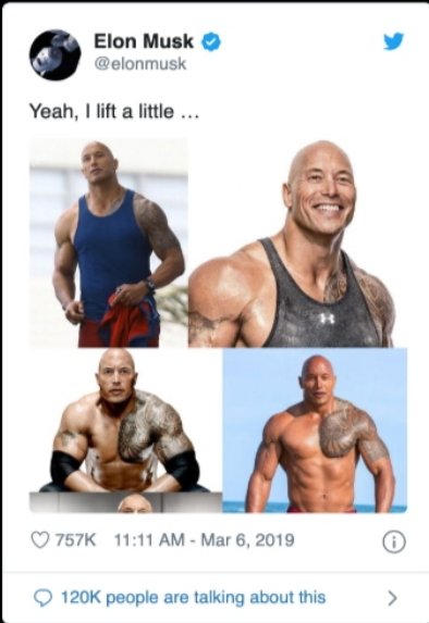
The image was made with Reflect app and tweeted by Elon Musk.