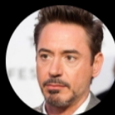
One face pic