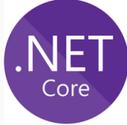
.NET Core (open source)