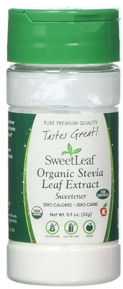
Roll over image to zoom in