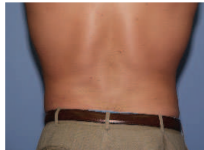
4 months post-ProLipo

The patient now benefits from a sculpted and defined torso.