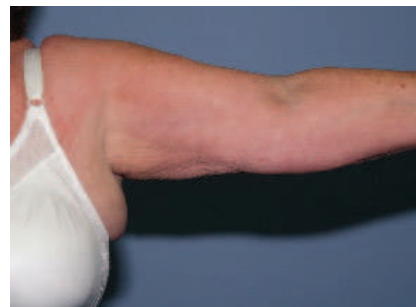
5 weeks post-ProLipo