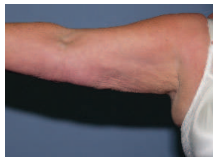
5 weeks post-ProLipo

Follow-up photo demonstrates considerably less volume, improved contour, and textural skin retraction.