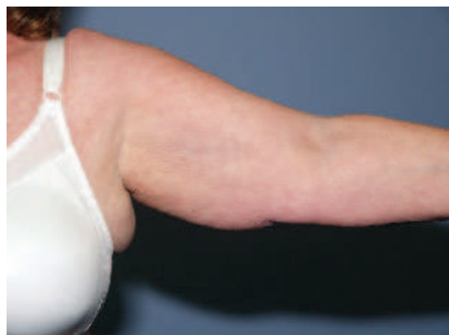
Left upper arm pre-ProLipo