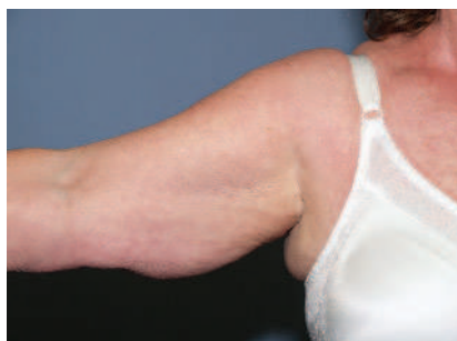
Right upper arm pre-ProLipo