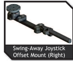
Swing-Away Joystick Offset Mount (Right)

Swing-Away, 1" Offset ..... $245 L R Left part: ACC148366. Right part: ACC148367 HCPCS: E1028