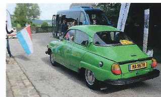
This Saab 96 Super was a head-turner

Over in Steinsel, a group of oversized American cars shared space with European classics and more, such as a '60s Russian Gaz M-21U Boaga, known as the Shark for the shape of its front grille.