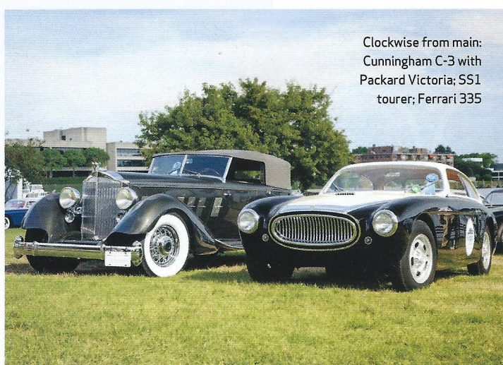
Clockwise from main: Cunningham C-3 with Packard Victoria; SS1 tourer; Ferrari 335