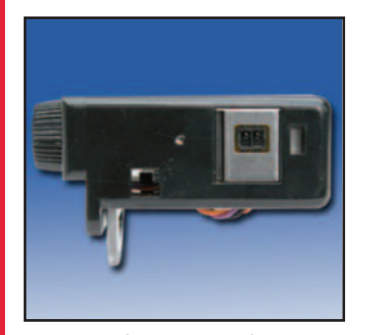
Optional Near End Sensor