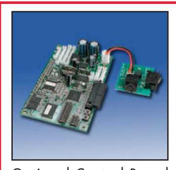
Optional Control Board