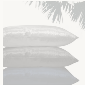
Satin Pillow Cases $13