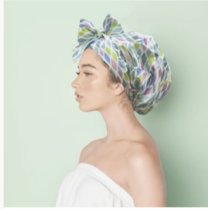
Adjustable Shower Cap $17.99