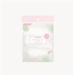
30 Pack Shower & Processing Caps $4