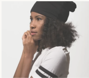
Satin Lined Jersey Beanie $13