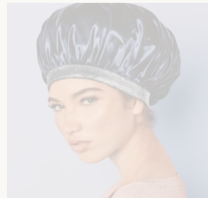
The Luxy Bonnet $9.99