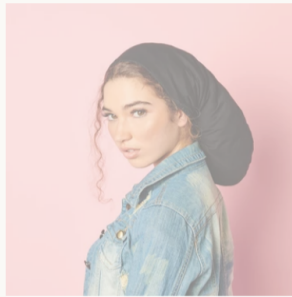
Extra Long 22" Jersey Beanie $15.99