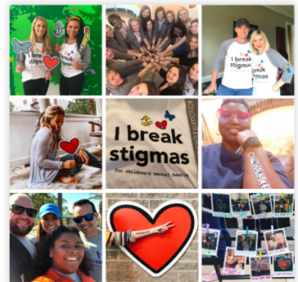
See what people are saying about On Our Sleeves.

In addition to advocacy and education, On Our Sleeves supports accelerating Behavioral Health research with a focus on Nationwide Children's Hospital, which operates the nation's largest program for child and