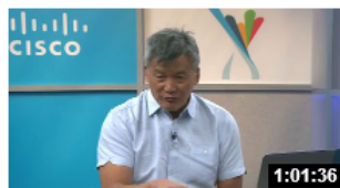
Cisco's Brand Personality