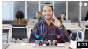
Cisco Webex Works Great with Google Calendar