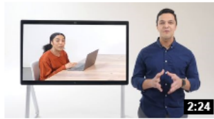
Meet the Cisco Webex Board