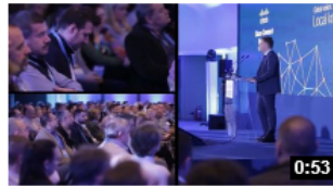
Cisco Connect Serbia