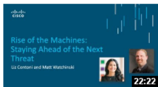
Rise of the Machines: Staying Ahead of the Next Threat