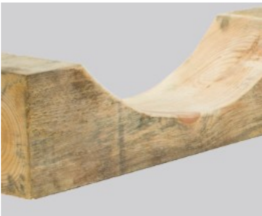
Custom Timber Pipe Supports