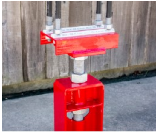
XPS-I Beam Adjustable Pipe Support