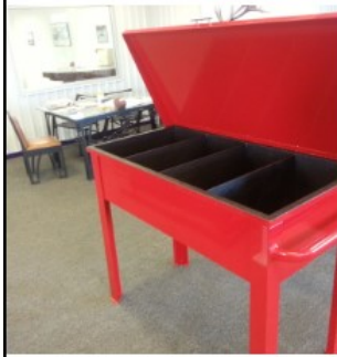
LOTO Storage boxes

This is an all aluminum construction tool box with an epoxy powder coat exterior with a bed liner coating material on the inside. The boxes are designed to hold LOTO boxes, locks, and all other necessary hardware