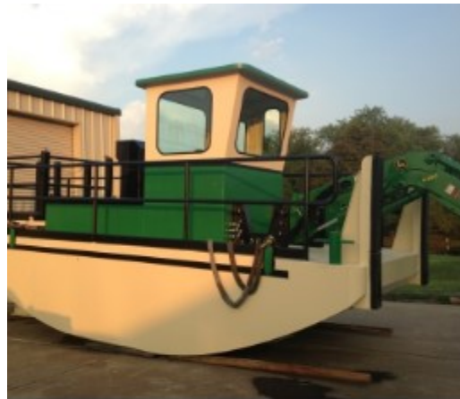
Custom Work Boats