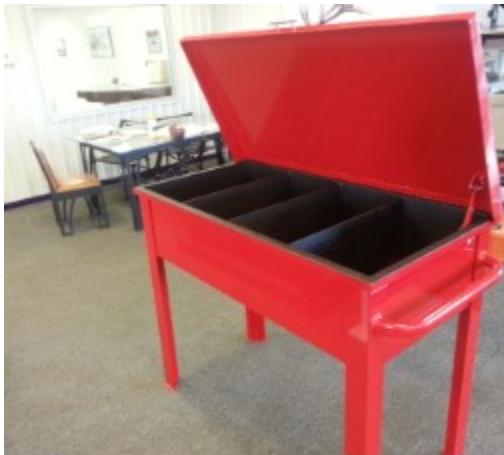
LOTO Storage Box