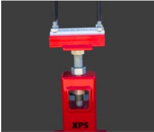
XPS-Adjustable Pipe Supports