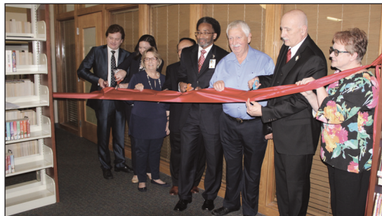
Dignitaries were on hand for the Ribbon Cutting on the Nations First "Virtual Living Room"

Earlier this year in June officials from the Department of Veterans Affairs Lexington Kentucky VA Medical Center made the trip to the Jackson County Public Library in McKee to sign a Memorandum of Understanding (MOU) forming a partnership between the VA, the Jackson County Public Library and Peoples Rural Telephone Cooperative (PRTC). As a result of this partnership, veterans from Jackson County and surrounding (SEE TELEMEDICINE - A-3)