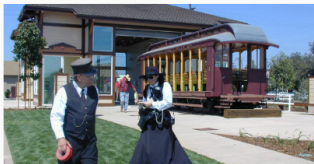
National City Art Walking Tour National City

#NationalCityMarina #SanDiegoBay #Wonderfront