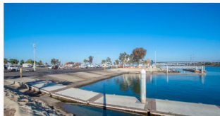
National City Boat Launch National City