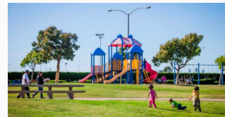
Pepper Park National City