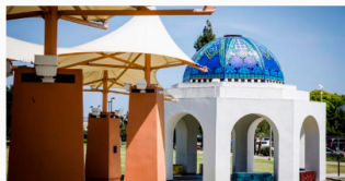
Harbor Island Art Walking Tour Harbor Island