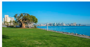
Harbor Island Park Harbor Island