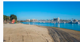
Spanish Landing Park Harbor Island

Adventure Rib Rides (Whale/Dolphin Watching)