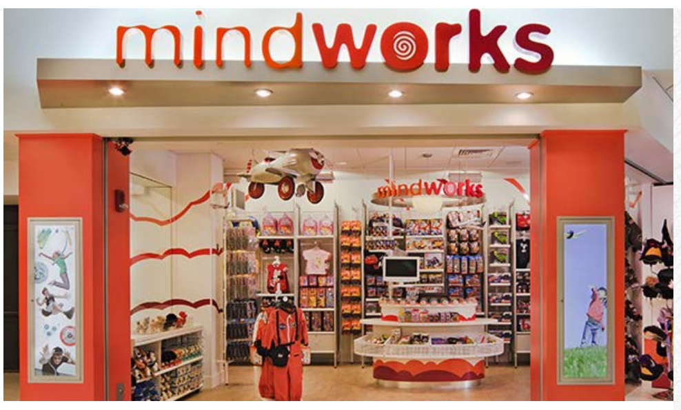
Our Stores – Stellar