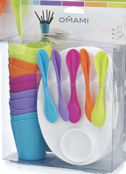
1779: Set with 10 White Plates, 10 Cups and 10 Mini Tasting Spoons in Assorted Colors

(assorted colors: purple, blue, pink, orange, green).