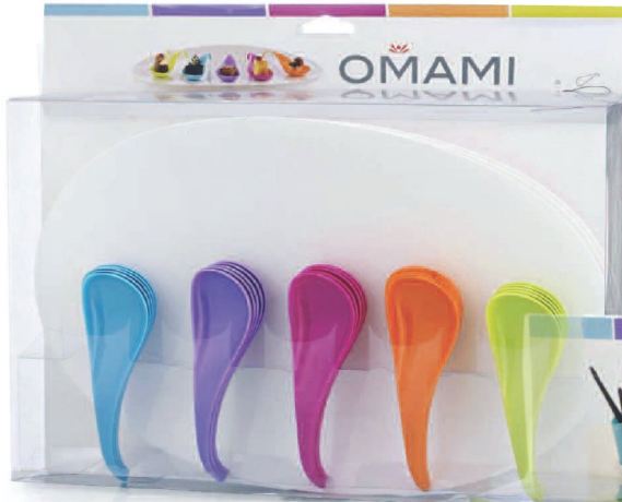
1781: Set of 3 White Trays and 25 Tasting Spoons