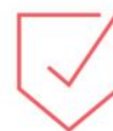
Product Safety & Regulatory