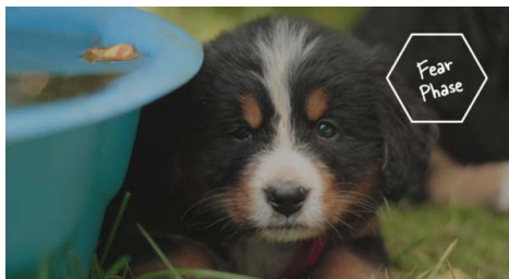
Helping Caesar Through the Fear Phase