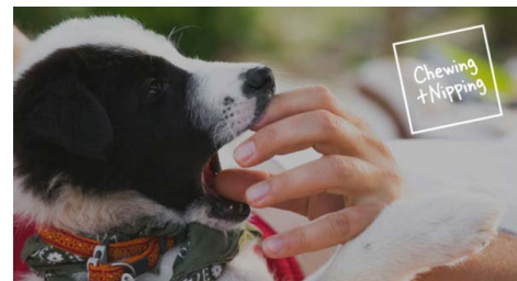
Teething 101: Beating the Teething Blues