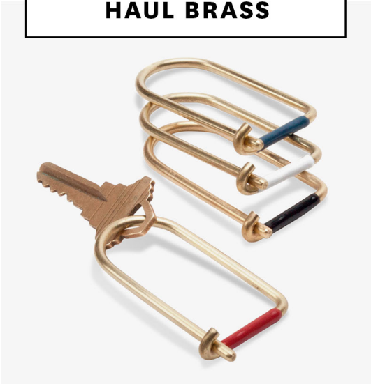
WILSON KEYRING CRAIGHILL / $15