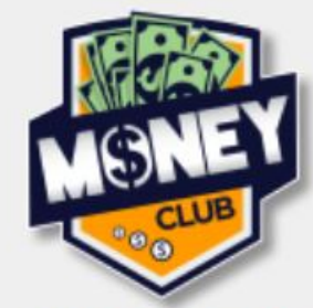
MONEY CLUB AGES 11 - 13