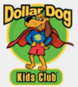
DOLLAR DOG AGES 3 - 6