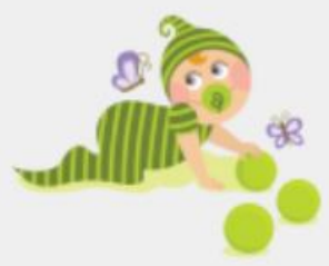
SWEET PEA AGES 0 - 2