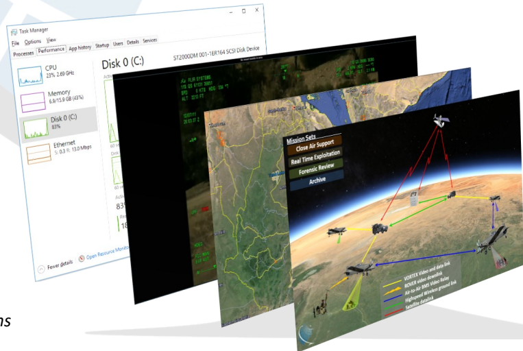
*Multiple models of intelligence collection and analysis available