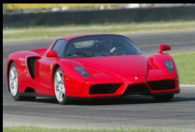
Our Noble M400 vs. Ferrari Enzo at ThunderHill