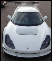
Rossion Q1 Performance