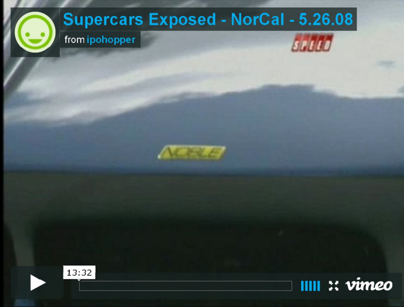
Noble M12 on Top Gear Review