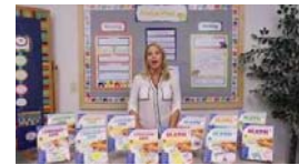
Interactive Notebook Training Video