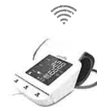
Blood Pressure Meter