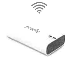
Home Link Bridge

We've designed the Profile™ smart wireless technology with you in mind. Each wireless device connects securely, then automatically uploads your data to ProfilePlan.net, allowing you to conveniently track and monitor your success from your smartphone or computer. By automatically collecting this information, we can further optimize your plan and advance the future research for Profile™ – all while keeping your personal stats safe and secure.