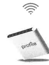
Step Intensity Pedometer