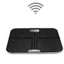
Smart Body Scale