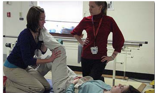
Duke DPT students spend almost 4,000 hours working with patients before they graduate.