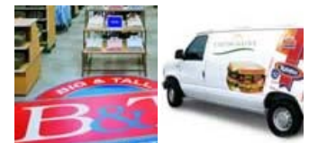
The store The highways