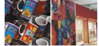
The table The wall