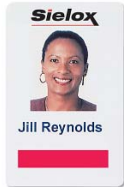
2.12" / 54.04 mm Graphics Quality Direct Print Also available with Magnetic Stripe