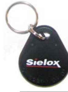
1.25" / 3.17 mm Key Tag