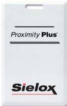
2.12" / 54.04 mm Clamshell