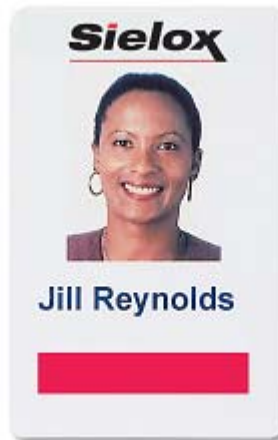
Graphics Quality Direct Print