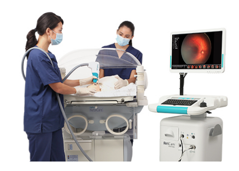
Tell me more about the RetCam Envision

How can we help you?* Please Select First name* Last name* Email* Company name*