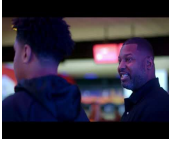
Working as a temporary employee provides second chance