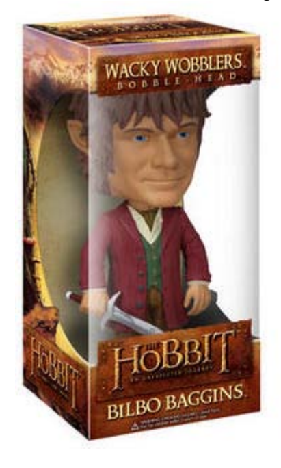
Mark: BILB BAGGINS, Registration No. 4321582