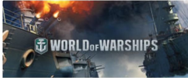
World of Warships