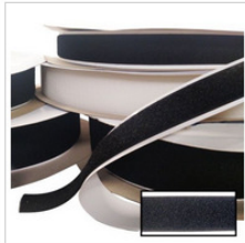
Adhesive Hook and Loop Series: GPS-H/L