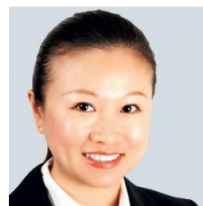
Serah Ye Analytics and Insights