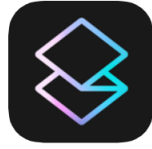
Superhuman — The F... Productivity