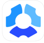
Hubstaff - GPS Time T... Productivity