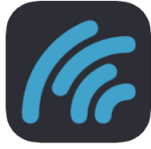
Truly: Business Phone... Productivity