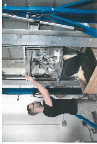
Seat Drop Tower