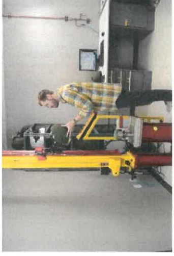
CADEX Monorail Drop Tower