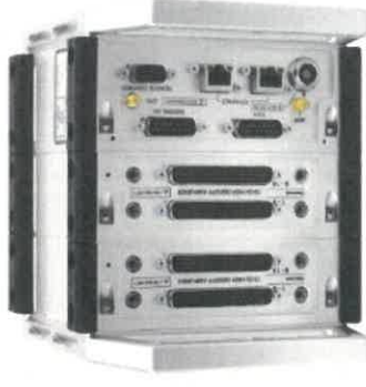
Data Acquisition Systems