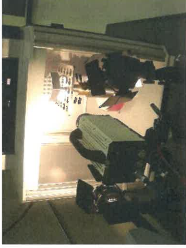
High Speed Camera