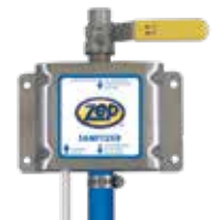
Wall-Mounted Sanitizer N80301