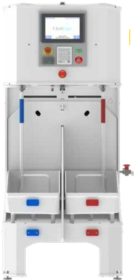
Custom ALX Chemical Allocation System