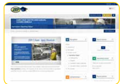
Online Training Center