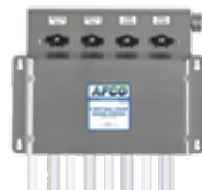
4-way Mixing Station AF08985400