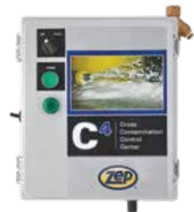
C4 Doorway Foamer W59901