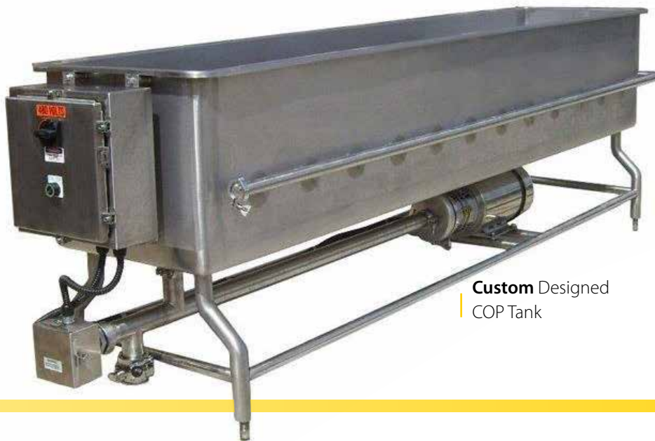
Custom Designed COP Tank