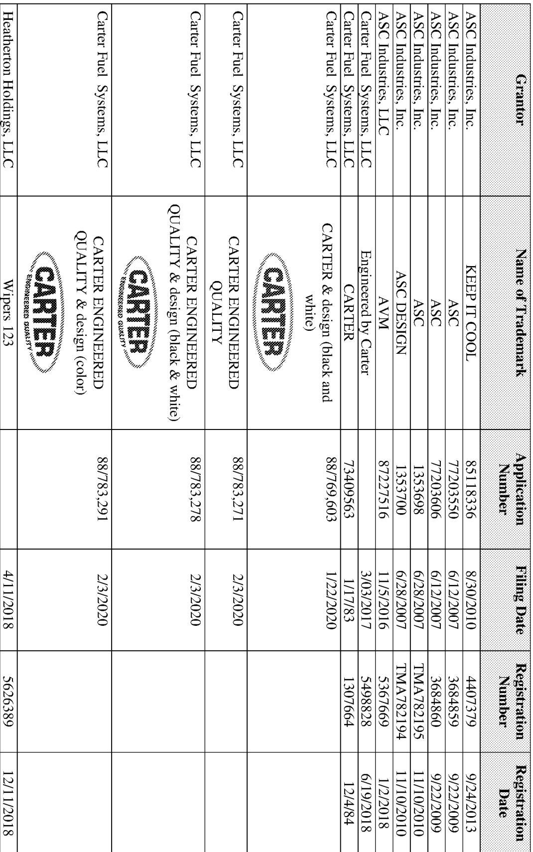
EXHIBIT A TRADEMARKS