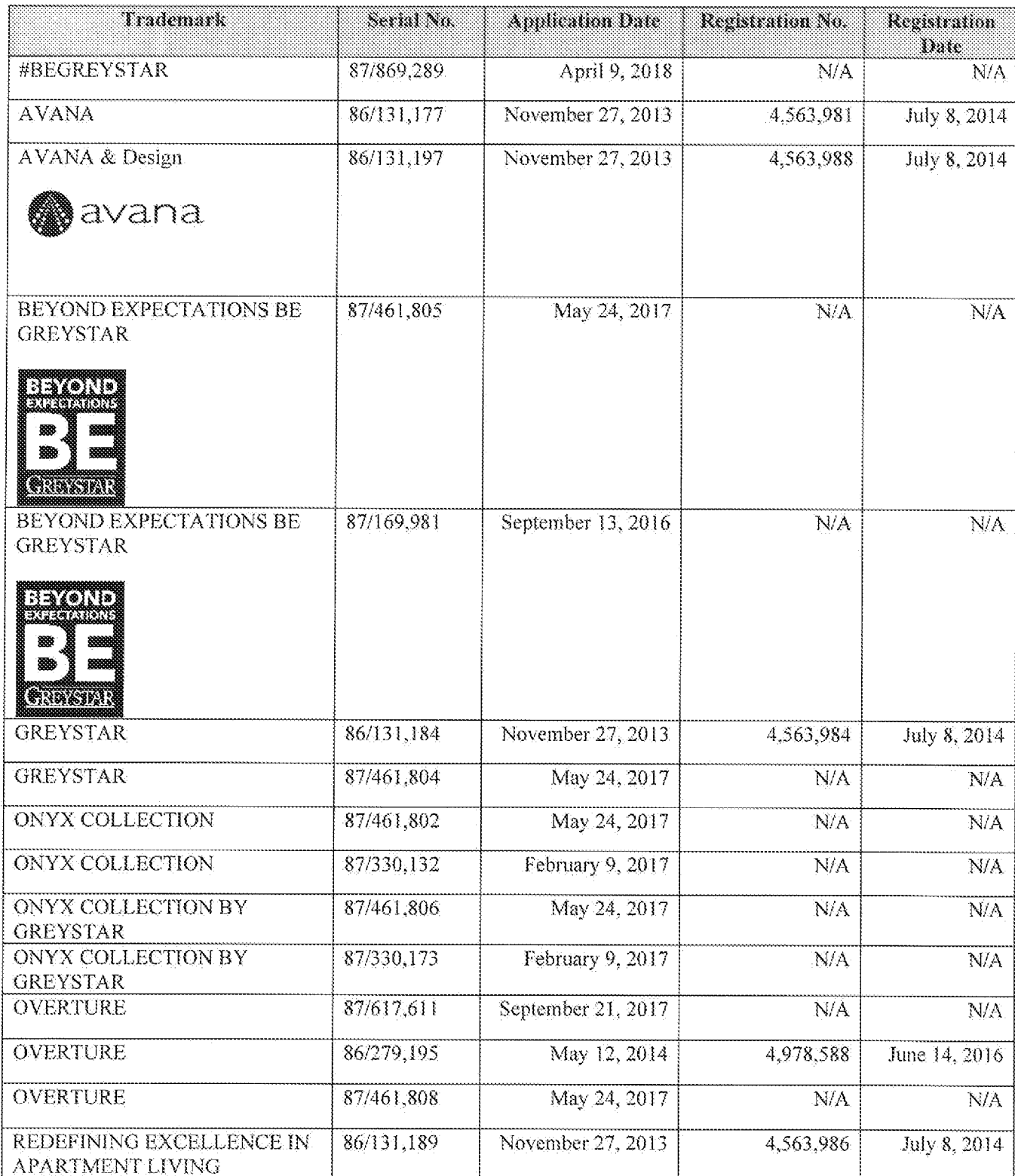
EXHIBIT A U.S. TRADEMARK APPLICATIONS AND REGISTRATIONS