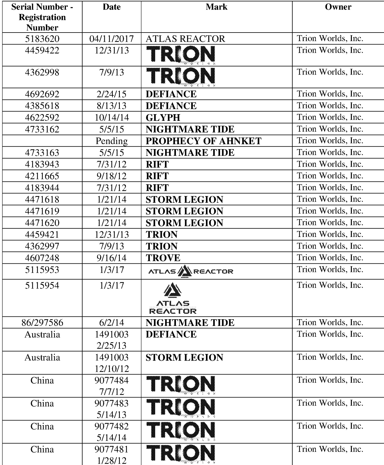
EXHIBIT 1 Trion Worlds, Inc. Trademark Schedule