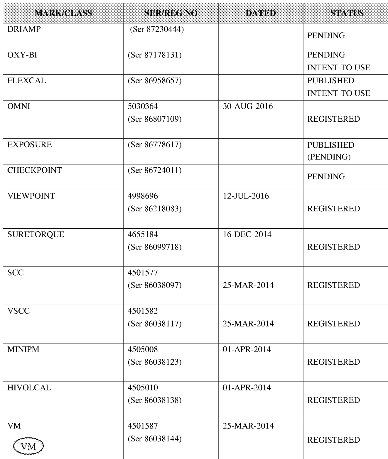
Exhibit A - SCHEDULE OF TRADEMARKS